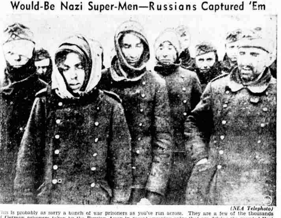
war prisoners as you've run across. -1 German prisoners taken by the Russian Army in recent sweeping gains that are driving the vaunted Nazi "super-men" from Red territory.

(Continued from page 1.) compensation law, making in dustrial insurance mandatory dustrial insurance mandatory upon all employers, permit the Inv Tuni state fish commission to assume