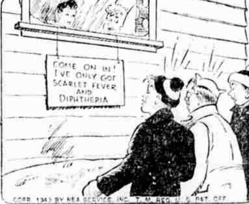
By Merrill Blosser