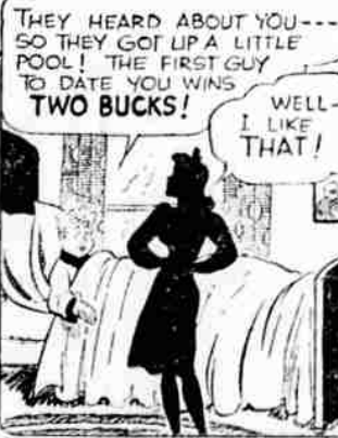
Eliminating the Competition