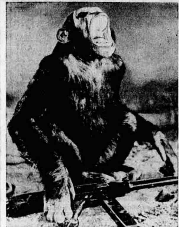
CHIMP IMP. Always the actor, Cheta, chimpanzee of the Tarzan films, cuts loose with a blood curdler when told that salary limitations may mean fewer peanuts to be eaten next year.