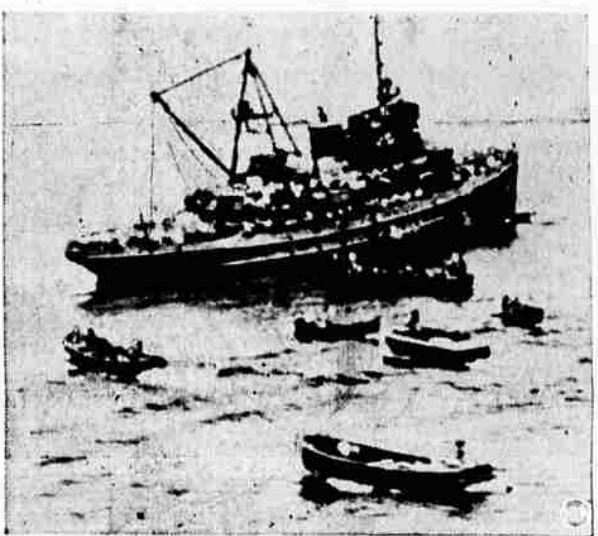
A U. S. Navy auxiliary vessel, already packed with rescued men, stands by to pull still more from the oily Solomon Island waters, where their U. S. Army transport, formerly the S. S. President Coolidge, went down after striking a mine.