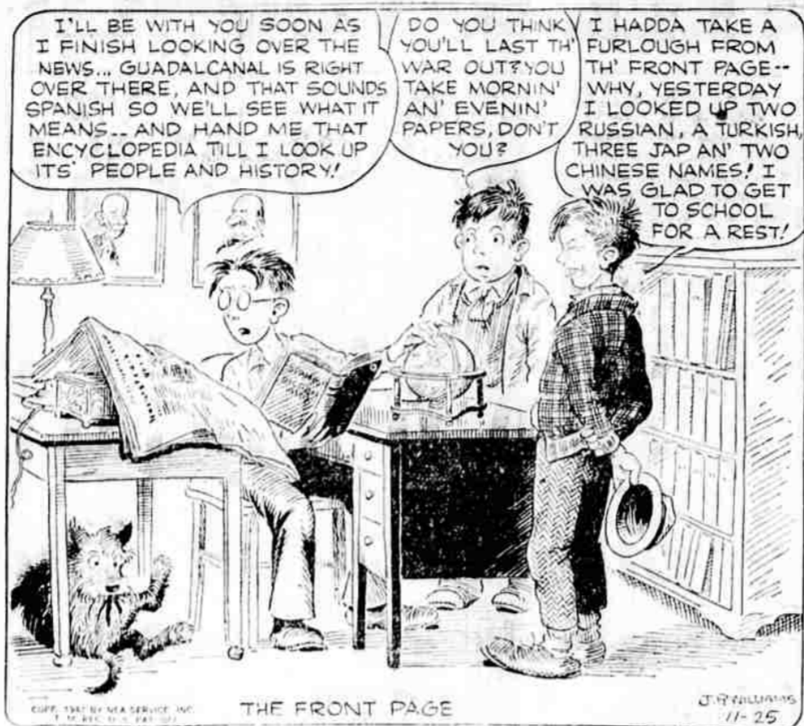
THE FRONT PAGE