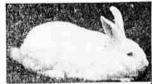
There's Money To Be Made with Rabbits if You Raise Them Right