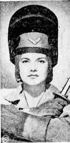
High style for shop wear is this pillbox and draped snood head-protecting hat for women welders. Chrome-tanned leather sleeves, leather apron and chamoisee gloves complete outfit for General Electric by Sally Victor, New York Mailer.