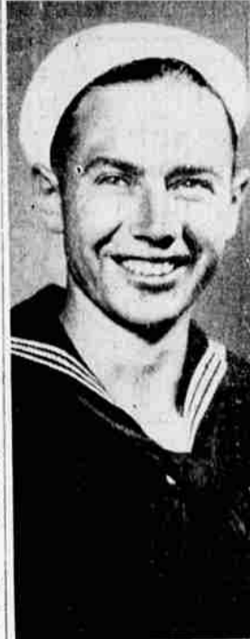
Days Creek, Ore., Nov. 22.