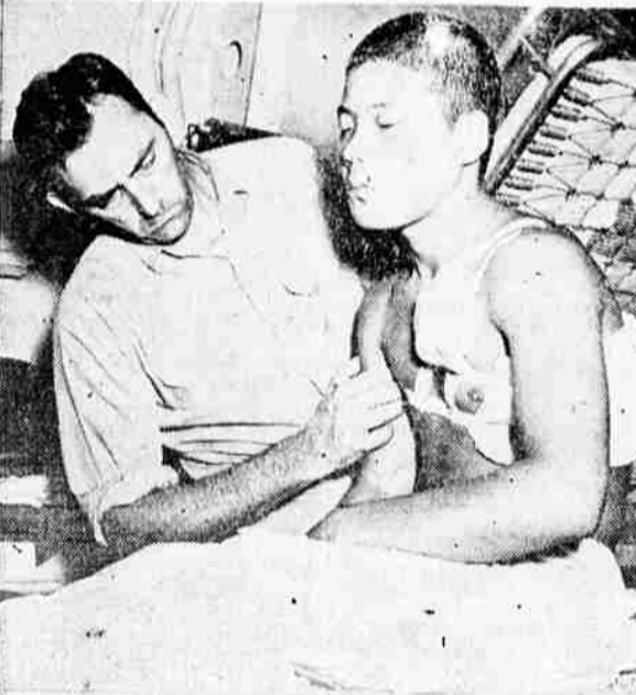
"Somewhere in the South Pacific" a young Jap "deadpans" it for the cameraman while receiving treatment for wounds suffered during sinking of two enemy patrol vessels recently near the Ellice Islands. The attacking U. S. ship rescued 16 Jap officers and men, most of whom were 17 and 18 years old. One captive was a boy of 12.