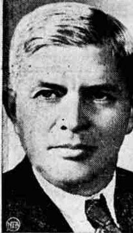
Charles E. Wilson, above, former president of the General Electric Co., was named this week by War Production Board Chairman Nelson to head a four-man unit to control the U. S. aircraft program. The move will place under civilian control the entire program, from scheduling to producing, which heretofore has been directed largely by various units of the armed services.