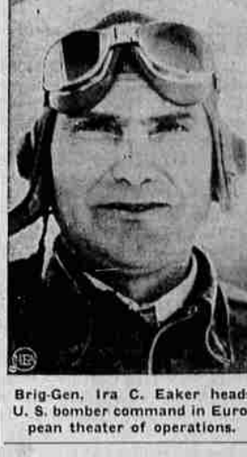
Brig-Gen. Ira C. Eaker heads U. S. bomber command in European theater of operations.