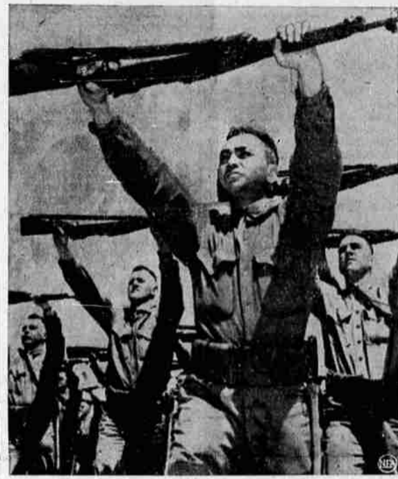
Corp. Barney Ross takes physical drill under arms with Marines at San Diego, Calif., base. Former lightweight and welter champion graduated honor man in his platoon following seven weeks' training.