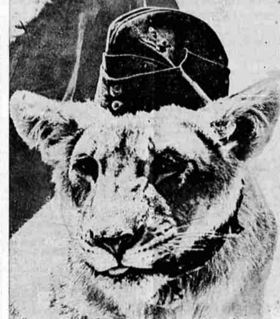
All dolled up, Dolly, 11-month-old lioness, mascot of a South African Pioneer Corps in the western desert, poses pleasantly for portrait. (Passed by censor.)