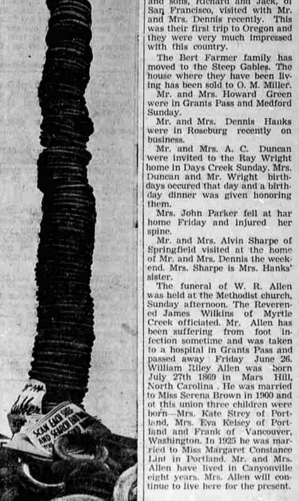
Lots of help in fighting the axis is represented by sky-high pile of old tires gathered as Los Angeles opened reclaimable rubber drive.