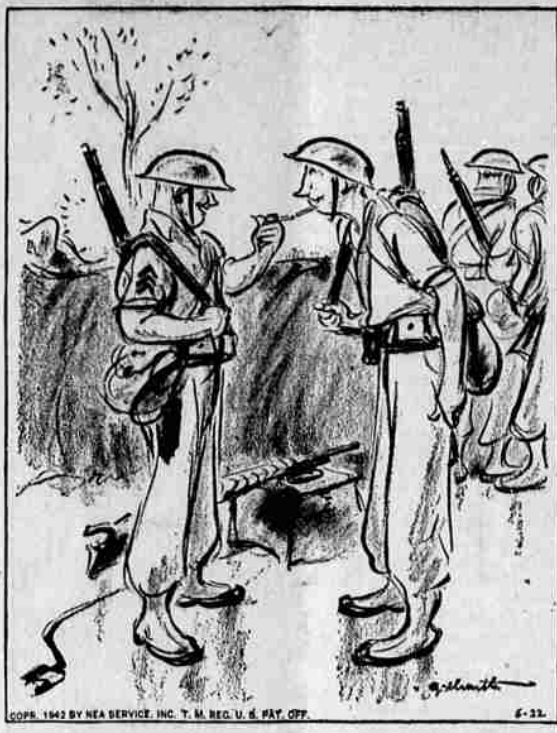
Sure, I'll help you to get a furlough! I haven't forgotten those fat tips you gave me when I was a waiter back in Pittsburgh!"