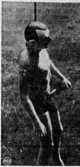
They not only hanged Adolf Hitler at Silver Springs, Fla., but ducked him in the clear waters of a spring, all in effigy, alas.

fixed by the office of price administration.