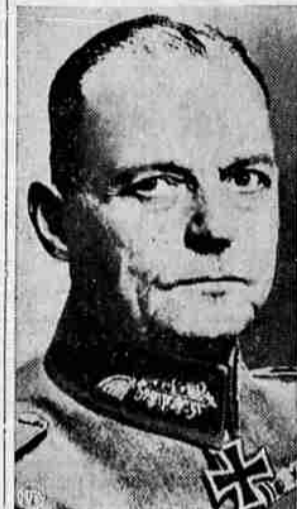
At upper left is one of Hitler's top generals, Karl von Rundstedt, reported transferred from the Russian front to France to combat increasing disorders there and perhaps prepare for possible allied invasion. Upper right is Gen. Henri Dentz, who fought the British in Syria, and has been chosen for a higher military post to collaborate with Laval in a pro-axis policy.