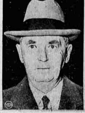
At right is Wm. D. Leahy, U. S. ambassador to France, who has been recalled to Washington "for consultation." The ambassador suffered a severe blow today in the death of his wife at Vichy, following an operation last week.