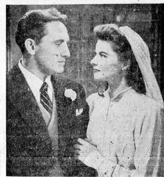
Spencer Tracy and Katharine Hepburn, co-stars of "Woman of the Year," grand comedy which opens Sunday at Hunt's Indian theatre.