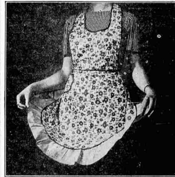
This dainty floral print apron is currently offered on a premium coupon basis by a well-known Pacific Coast cereal manufacturer. One of the more attractive premiums still made by war materials shortages, this long-wearing apron is made of eighty square percale, has a saucy organdy flounce and is bound at the edges with matching bias tape.