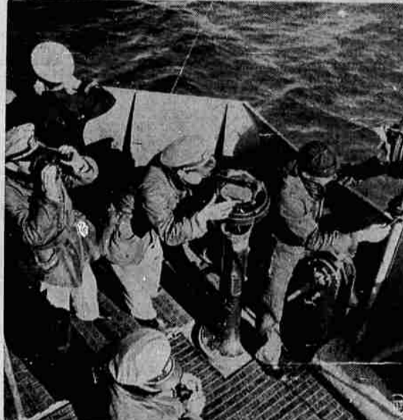
Eternal vigilance is also the price of safety, and this scene on the flying bridge of a destroyer on convoy duty on the Pacific gives the alert tone. One officer takes bearings with a polaris, a signalman blinks in code to another ship as merchantmen in convoy are escorted by war craft.