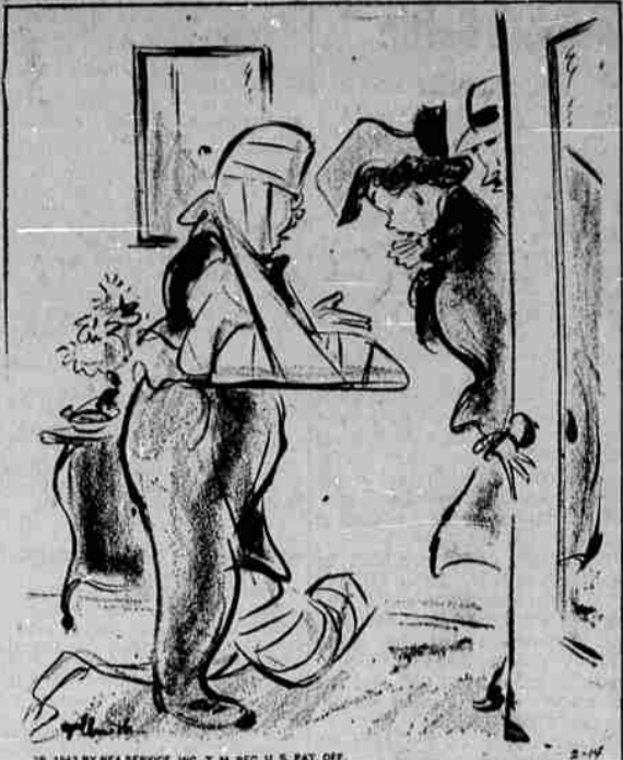
Come on in, I'm all right—my wife is just taking me to a victim for practice in her first aid course."