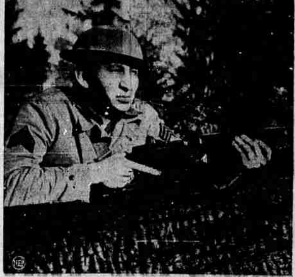
Keen-eyed Sioux Indian Army scout has his rifle ready to deal with any enemy threatening our western coastline. Indians, who know northwest woods country well, were used as scouts in World War I.