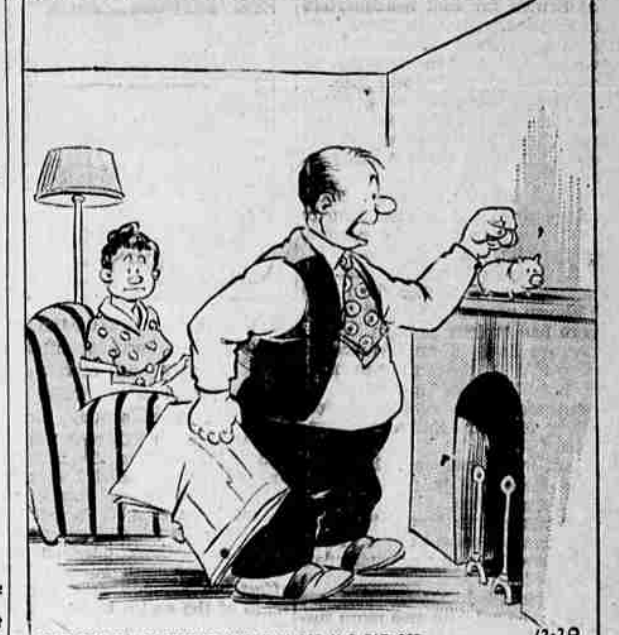
"Well, Christmas is over—now we can start saving for income taxes!"