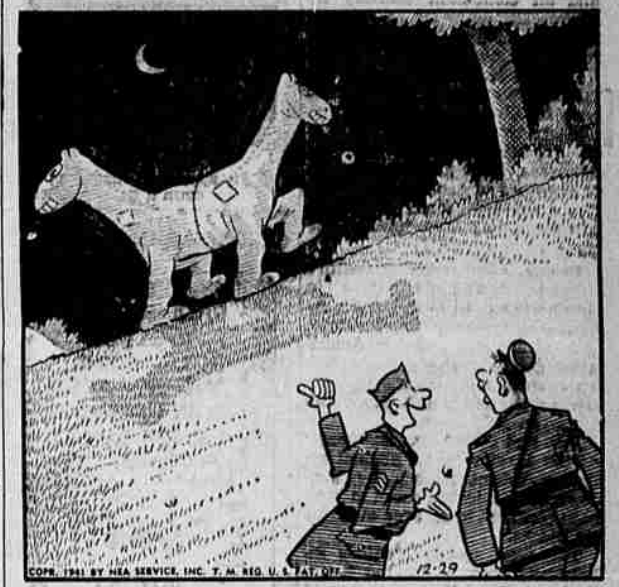
"That's so they can slip past the enemy sentry—he'll think he's having a nightmare!"