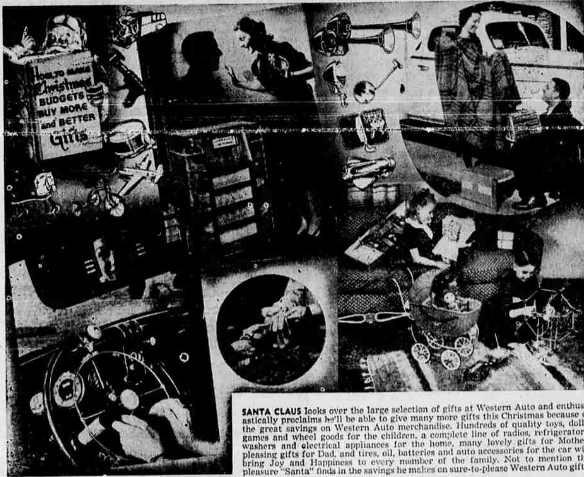
SANTA CLAUS looks over the large selection of gifts at Western Auto and enthusiastically proclaims he'll be able to give many more gifts this Christmas because of the great savings on Western Auto merchandise. Hundreds of quality toys, dolls, games and wheel goods for the children, a complete line of radios, refrigerators, washers and electrical appliances for the home, many lovely gifts for Mother, pleasing gifts for Dad, and tires, oil, batteries and auto accessories for the car will bring joy and happiness to every member of the family. Not to mention the pleasure "Santa" finds in the savings he makes on sure-to-please Western Auto gifts.