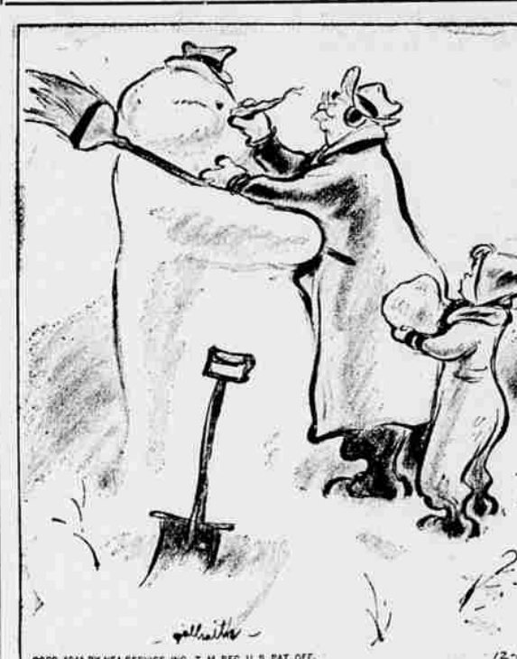
"Make him look like an old man, Grandpa—a lot older than we are!"