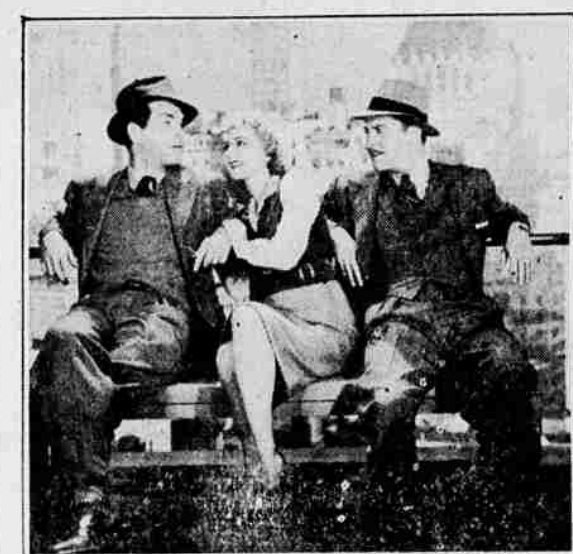
Fred MacMurray, Mary Martin and Preston Foster in a scene from "New York Town," which opens Sunday at Hunt's Indian theatre.