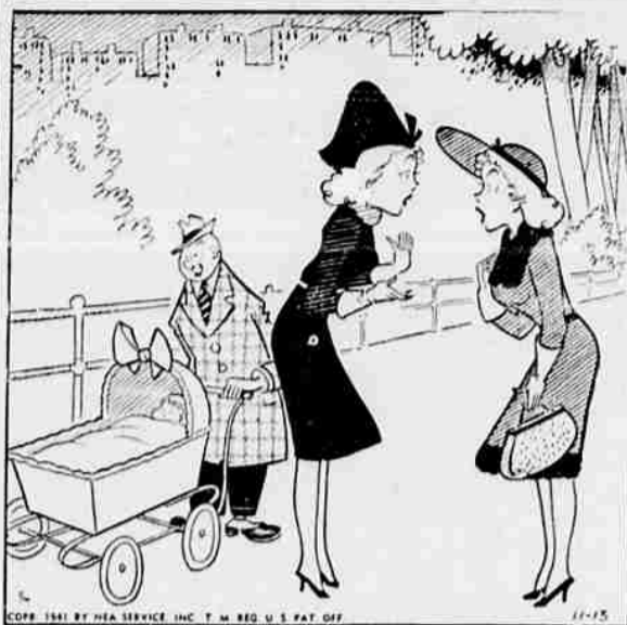
"I could have married a six-footer, but I took off 20 percent for cash!"