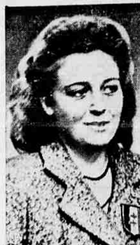
This is the first picture of the mysterious Miss X, the 18-year-old French girl who eluded the Germans, sailed 250 miles in a 12-foot boat, and was picked up by a British patrol after five days at sea.

plea last week that his cows would lose that contented look and fall off in their milk production if moved to strange surroundings, a jury yesterday awarded $16,500.