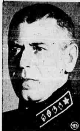
Gen. Boris M. Shaposhnikov, above, succeeds Gen. G. K. Zhukov, onetime defense vice commissar, as Russian army chief of staff in effort to stiffen Soviet resistance.