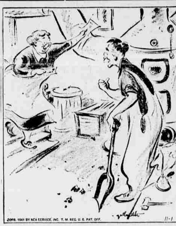
"It's from the foundry, Tom! They don't care if you are getting old—they say you're a skilled man and they want you to come back to work!"