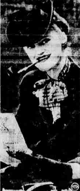
Because of London's cigaret shortage, this isn't such an unusual sight today. A girl employe of the Ministry of Supply enjoys pipe with paper in Hyde Park.