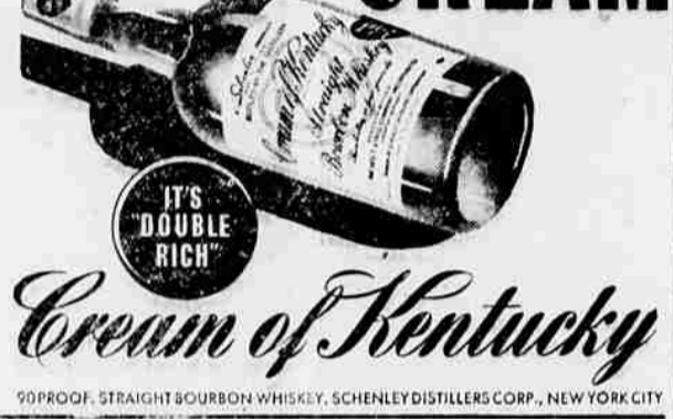
90 PROOF, STRAIGHT BOURBON WHISKEY, SCHENLEY DISTILLERS CORP., NEW YORK CITY

Massive beauty RIDE IN STYLE big-low-modern lines