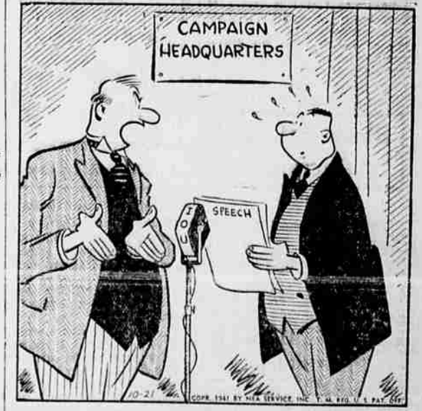
"No, no! You'll never get anywhere in politics until you convince the voters that something ought to be done about something!