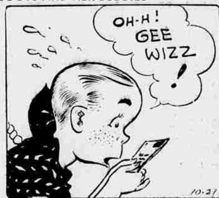
BOOTS! HERE'S A