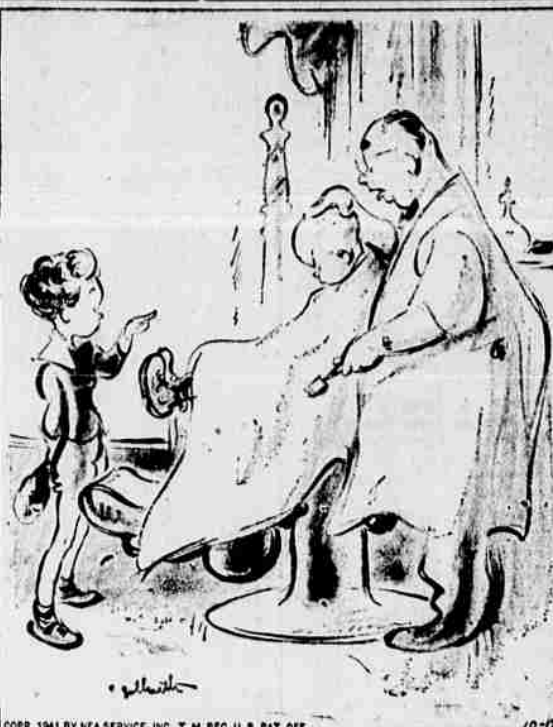
"You'll have to bring your mother in, Johnny, if you want a haircut like Butch's—I won't stay in business a while longer!"