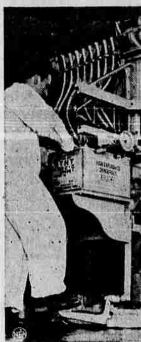
Add dangerous jobs: nailing covers on 50-pound boxes of TNT, all in the day's defense work at Kankakee, Ill., ordnance plant.