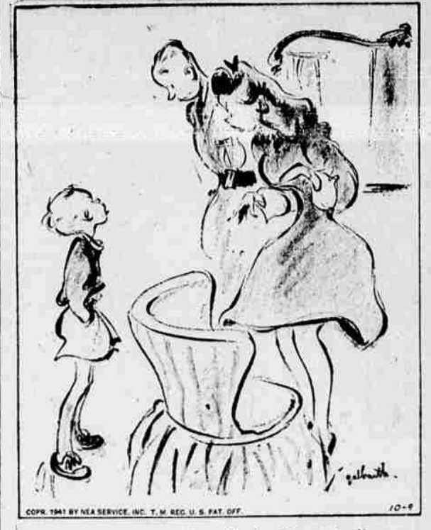
"You'd do me a favor if you'd take Sis out to dinnerotherwise I get only one chop.