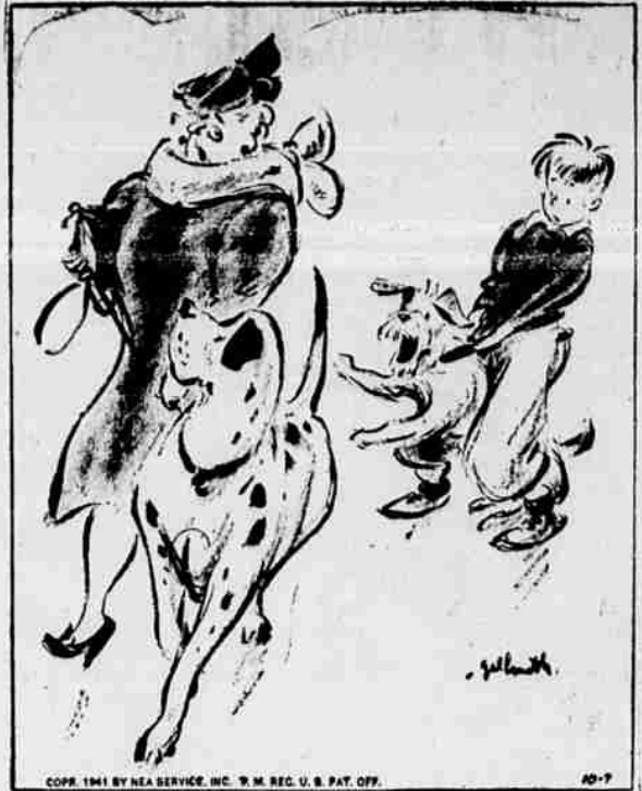
"Steady, Sir Walloole—ignore the ruffian!"