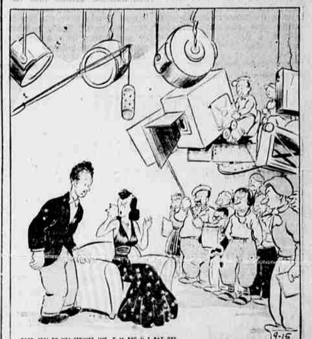
"Go away—can't you see I want to be alone?"