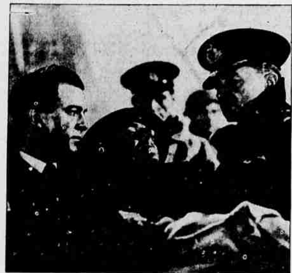
Clive Brook and actors in a scene from "Convoy," a picture full of action in the new war, now playing at the Rose theatre.