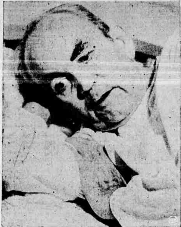
Twenty-five years after the famed San Francisco Preparedness Day bombing of 1916 sent Tom Mooney to prison to become labor's cause celebre, Mooney spoke from a hospital bed, his health shattered but spirit unbroken. In his first interview since becoming ill, he spoke in sharp contrast to the young man, who a quarter of a century ago would have accepted martyrdom to keep his country out of war. Now, he says, if he had his health, he would shoulder a gun and lead the working man into battle against Hitler.