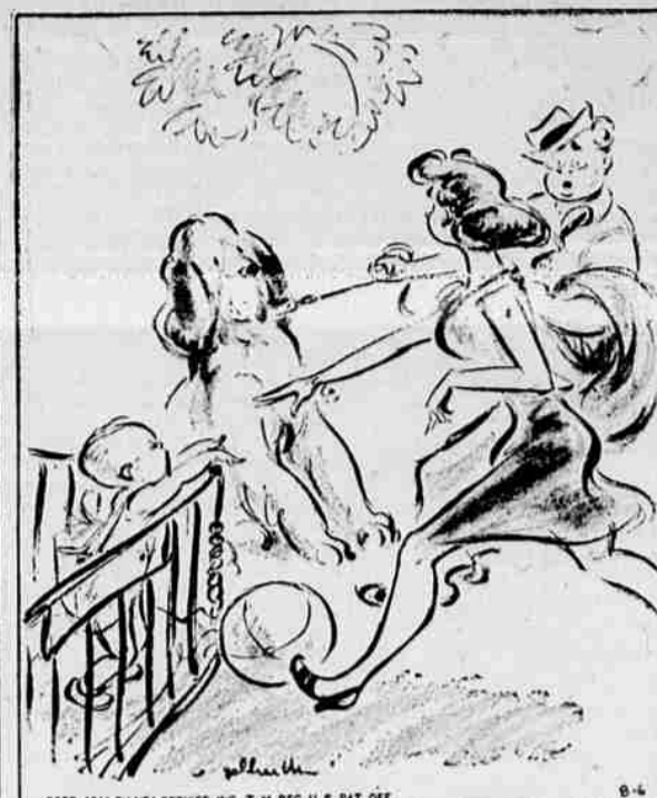
"Every boy needs a dog, so I brought this puppy for Junior to grow up with."