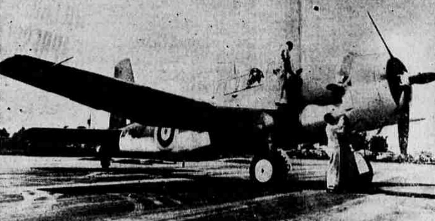
Here's the first picture of America's newest, deadliest dive bomber—the new 1600 horsepower Vultee "Vengeance"—claimed to be more powerful than Germany's dread Stuka. It has a wing-spread of 48 feet and seats two. Specifications are a military secret.