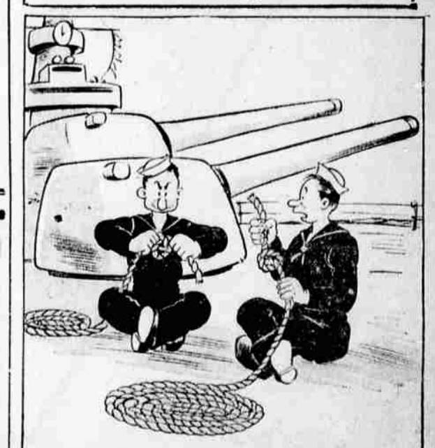
"I always thought the ship made the knots—not the sailors!"