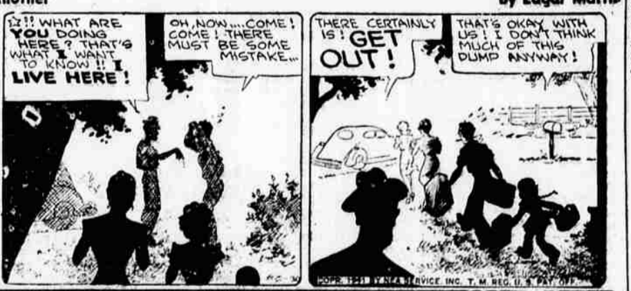
By Roy Crane