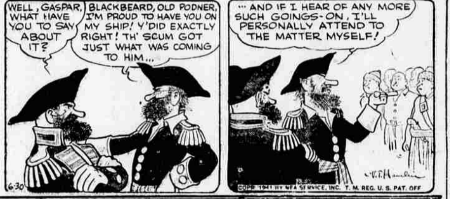
One Thing After Another