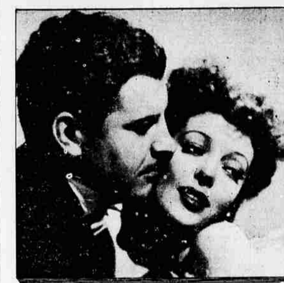
Humphrey Bogart and players in a scene from the "Wagons Roll at Night," which starts Sunday at the Rose theatre.