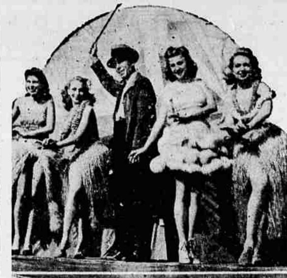
Robert Preston and Loretta Young, coming Sunday in "The Lady From Cheyenne," to Hunt's Indian theatre.