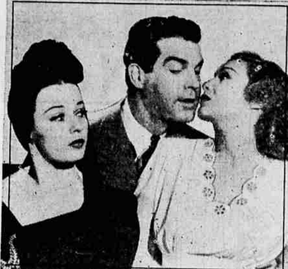
Patricia Morison, Fred MacMurray and Madeline Carroll, stars of "One Night in Lisbon," which opens a three-day showing Sunday at the Indian theatre.