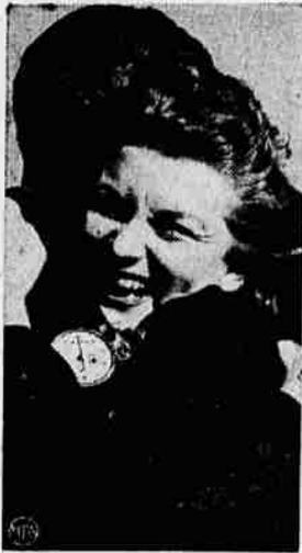
How much, girls, does he love you? This little machine records order of his embrace. Built by General Electric to measure pressure exerted by electrodes of spot-welding machines, gadget's used here to show fellow has 75-pound hug.