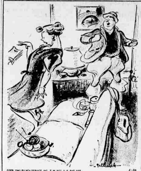
"Thank goodness you've found that artificial perch—I've been looking all over for it!"