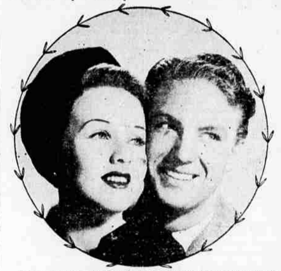
Deanna Durbin and Robert Stack, featured in "Nice Girl," which opens a three-day run at the Indian starting Sunday.