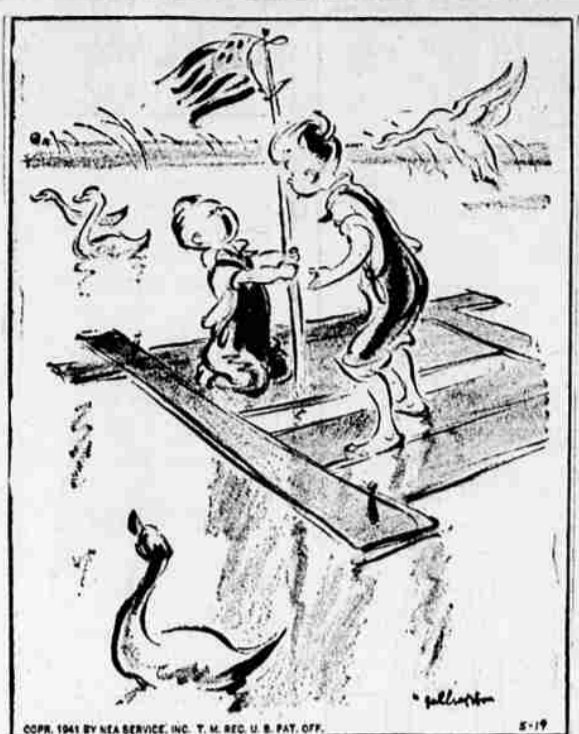
"What are you afraid of? We got a convoy, planes, and everything!"