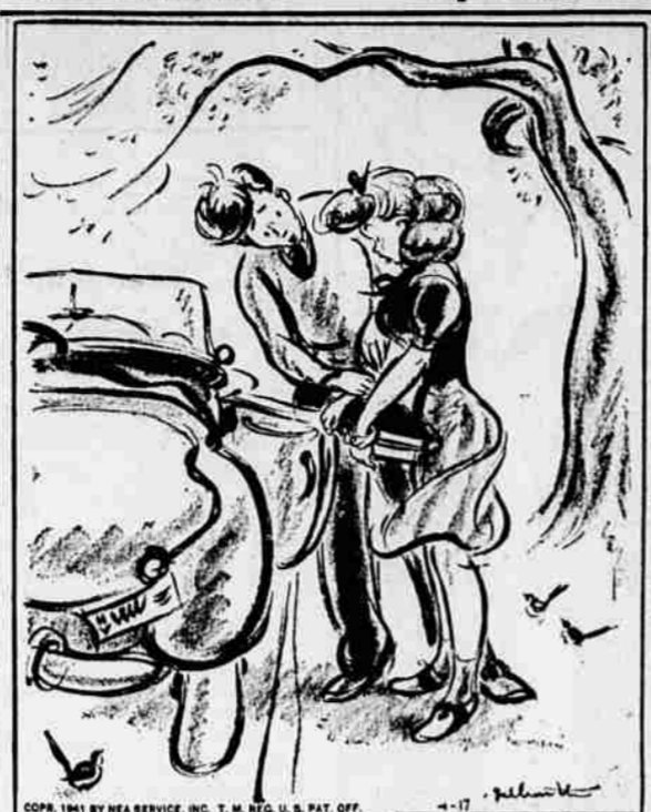
"I have enough gas to go around the block a couple of times—or should we park right here and discuss things?"