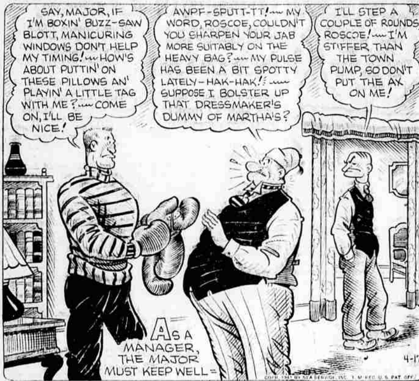
AS A MANAGER, THE MAJOR MUST KEEP WELL.