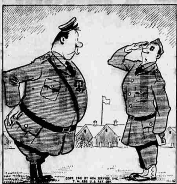
"I have a few suggestions to make to improve the army, sir!"