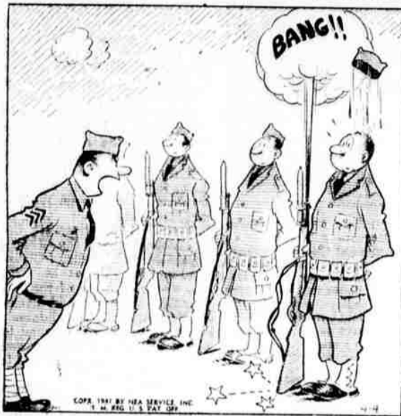
"And since when have you been in the anti-aircraft corps?"