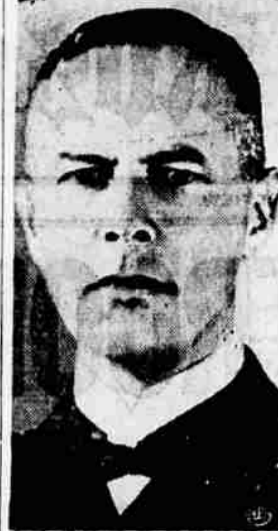
In command of German surface raiders now operating in the Atlantic is Admiral H. Luetjens, according to announcement by German high command.

Delicious... for fishers... welcomed at home... quick to prepare... saves cook's time... economical... order, today, from your grocer.