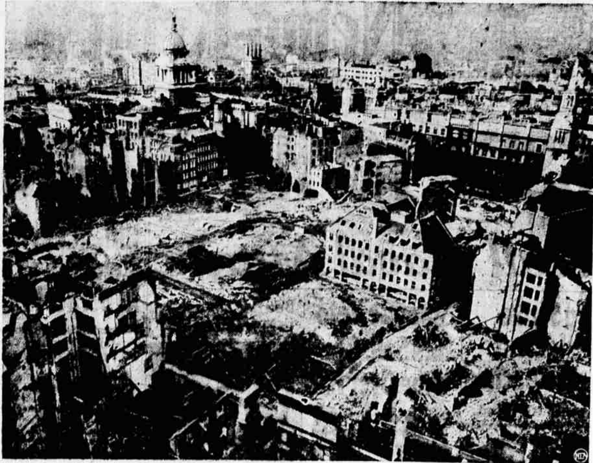
This is the heart of London today... looking northwest from the dome of famed St. Paul's cathedral toward Old Bailey tower. Buildings that once stood in the open spaces have been demolished because, weakened by blasts of German bombs, they would menace public safety if left standing. Shells of buildings nearby are soon to be wrecked. This exclusive and historic photo has just reached the United States.