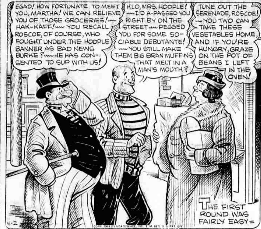
THE FIRST ROUND WAS FAIRLY EASY