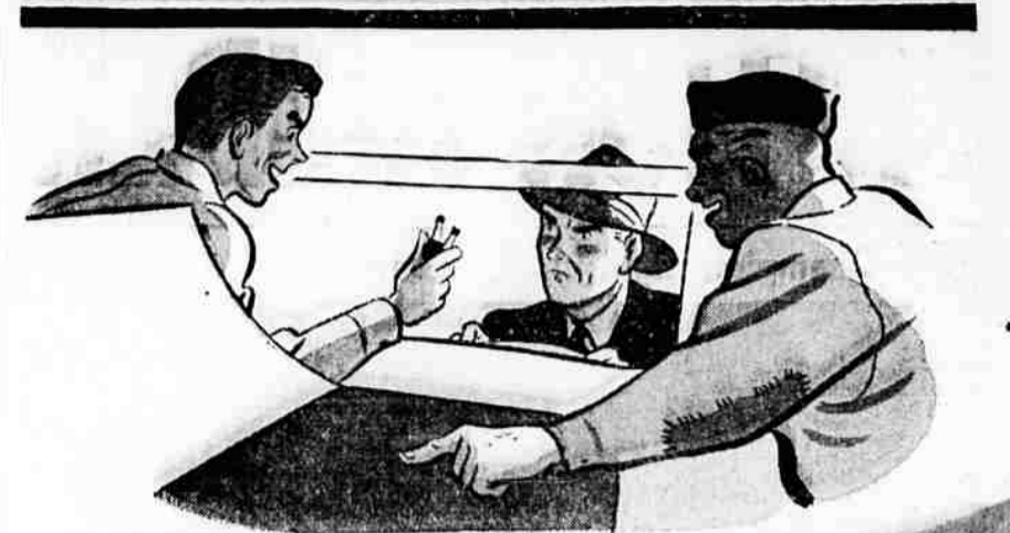
PESTERED BY HIGH PRESSURE!