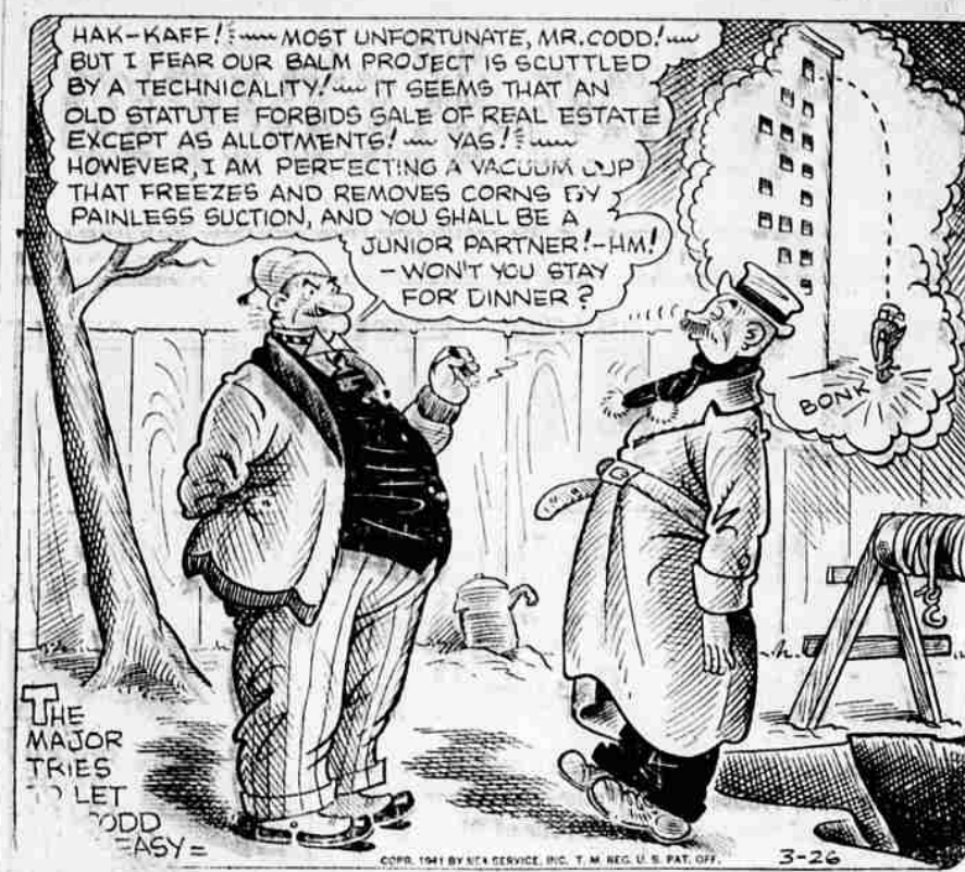
THE MAJOR TRIES TO LET CRODD EASY =