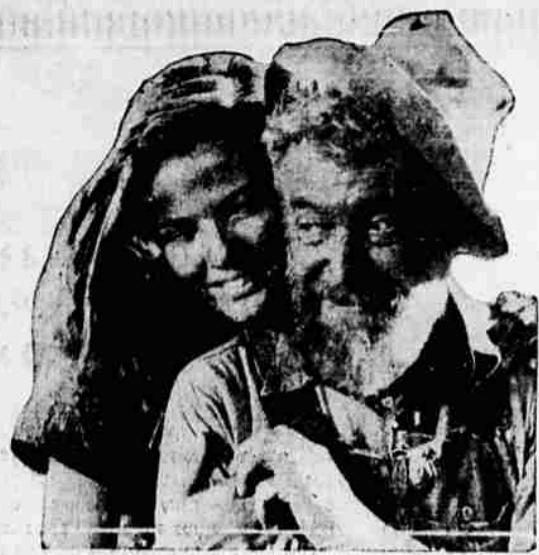
Gene Tierney as "Ellie May," and Charles Grapewin as Jeeter Lester, coming Tuesday to Hunt's Indian theatre in the film version of "Tobacco Road."

must seek wider understanding of the possibilities for that future we prepare to defend.