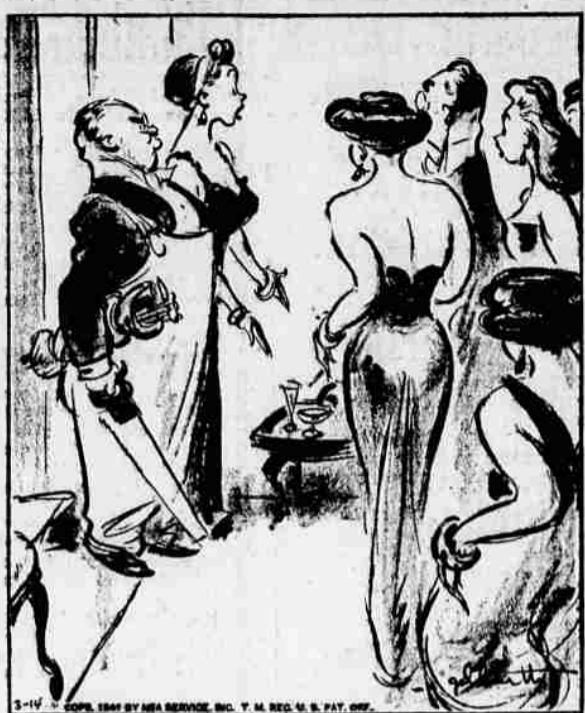
"You won't mind, I hope, but we'll all have to go to the basement and see my husband's lathes and what he's doing to speed up the defense program!"