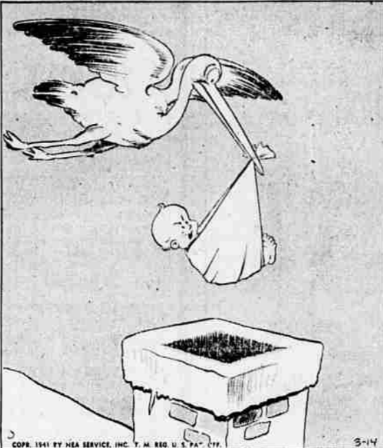
"Hey! Not here, you dope—this is the Old Ladies' Home!"