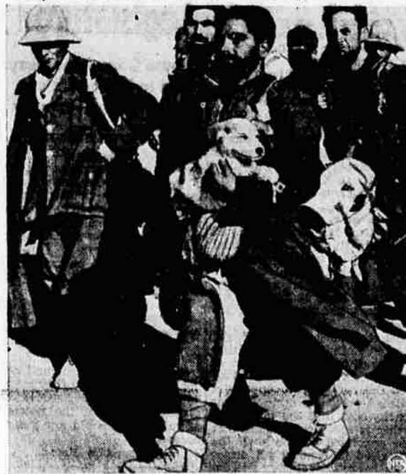
The Italian soldier in the foreground, one of thousands captured by the British in their whirlwind offensive against Italy's Libyan forces, doesn't look too upset by the turn of events—at least he managed to keep his pet pup. But the fellow at the right, scowling at the cameraman, doesn't seem to relish his predicament.