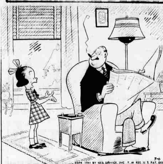
"But if you're not married, Uncle Elmer, who tells you what not to do?"