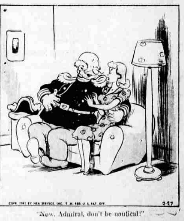
"Now, Admiral, don't be nautical!"