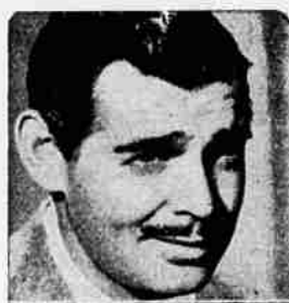
Clark Gable, starred in "Comrade X" which opens at Indian Sunday.