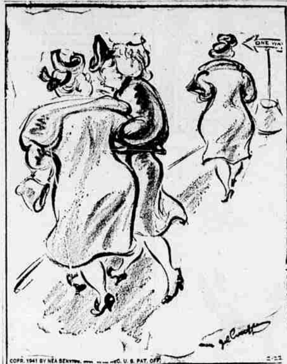
"She claims she wears a size 14 dress, but everybody knows she has to have it steamed bigger!"